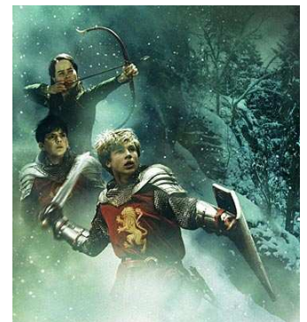
「魔幻王國」 The Chronicles of Narnia 教導年青人正義、勇敢、忠心和犧牲精神。

樂界要極力介紹同性戀的電影，是要打破傳統的禮教，讓放縱情慾的人，可在無罪惡感的情況下自由自在地繼續放縱，而社會需要無條件地接受。利用潮流文化來推廣破壞家庭的電影，是現代文化的悲劇；李安導演拍這種片子，等於加入破壞的行列，是華人的悲劇和恥辱。