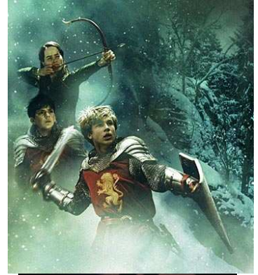
The Chronicles of Narnia promotes healthy family values such as decency, loyalty, courage and sacrifice.

shows it with prestigious movie-making awards. Such commendation of deviant behavior and the attack of the traditional family illustrate the tragedy of the pop culture today. When an Asian director joins the destructive force in breaking the moral code of what most Asian parents believe in, it is a tragedy for Asian Americans.