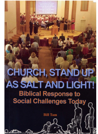
New book for Sunday School Order online: www.tfcus.org

2005, a new strain of HIV is discovered that has a 2-month latency period rather than the 10-year period once known to the health authorities."